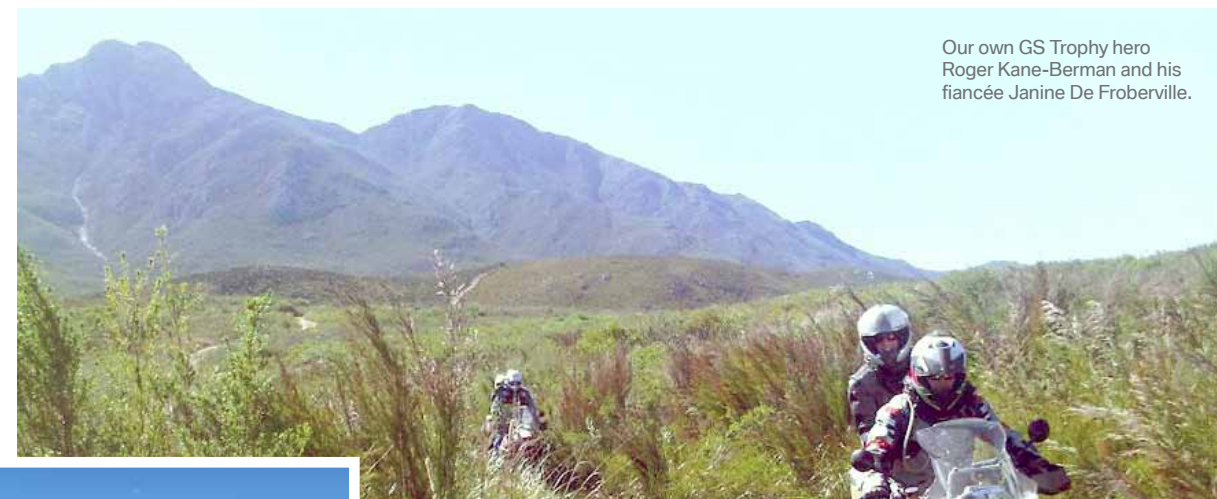
Bike traffic jam at Attakwas Pass.