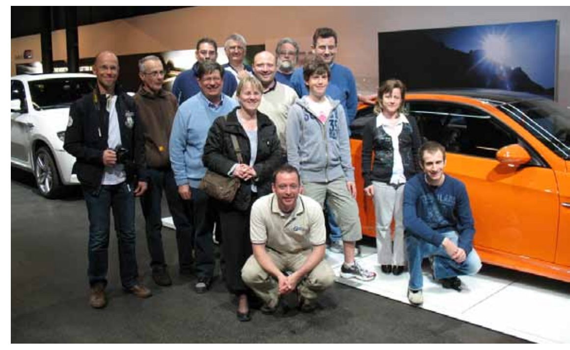
Our excited members at the BMW M Studio.

The first preparations therefore started to take shape back in January, mid-April being considered as the ideal travel period. We managed to gather a team of thirteen enthusiastic folks to enjoy the event – and no, we are not superstitious at all. It was clear that the programme had to include a tour of all the main points of interest: BMW Classic, the new BMW Museum, the BMW Welt, BMW M and the BMW Munich Plant. Admittedly, it was the team of the BMW Clubs International Office that made it all happen for us at short notice. And all our wishes were fulfilled! Unfortunately, our tight schedule didn't allow