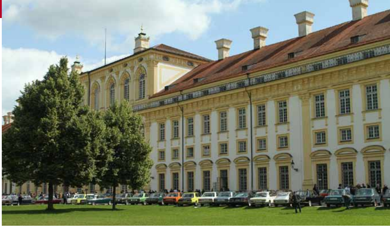
Line-up in front of the Schleissheim New Palace.