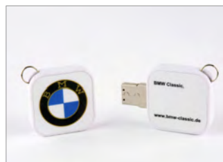
BMW Classic USB flash drive (4 GB) with BMW Museum screen saver. € 16.11