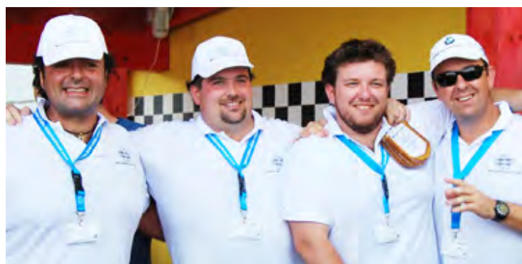
The organising team.