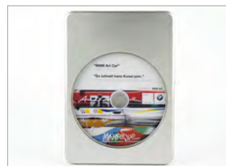
BMW Classic DVD's. from € 27.00