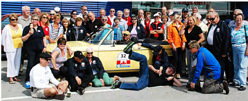
Souvenir photo of all participants.