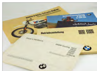
Original and reprints of original BMW Instruction Manuals. from € 4.50