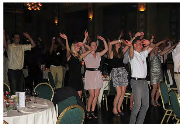
Euphoria at the gala evening.

Plan at least one overnight stay – we still have some Roadbooks left over!