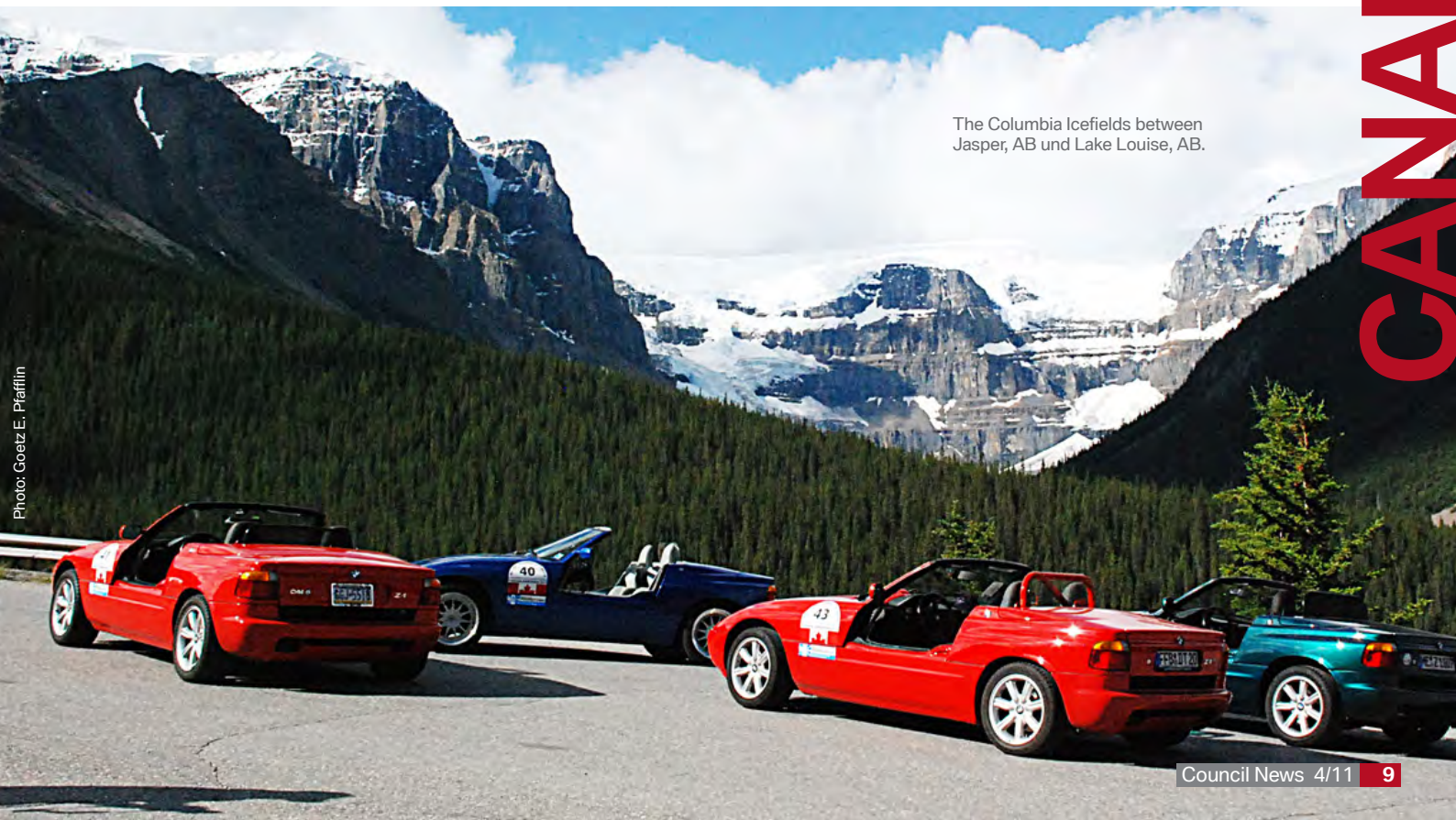
The Columbia Icefields between Jasper, AB und Lake Louise, AB.