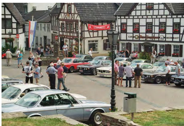
Presentation of the vehicles on the Ziepchensplatz.