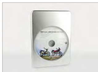
BMW Technical Publications. € 45.00