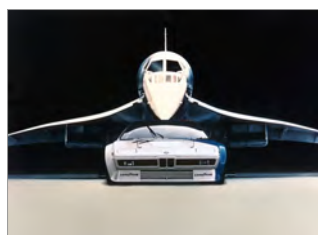
BMW Classic Fine Art Prints. from € 18.00