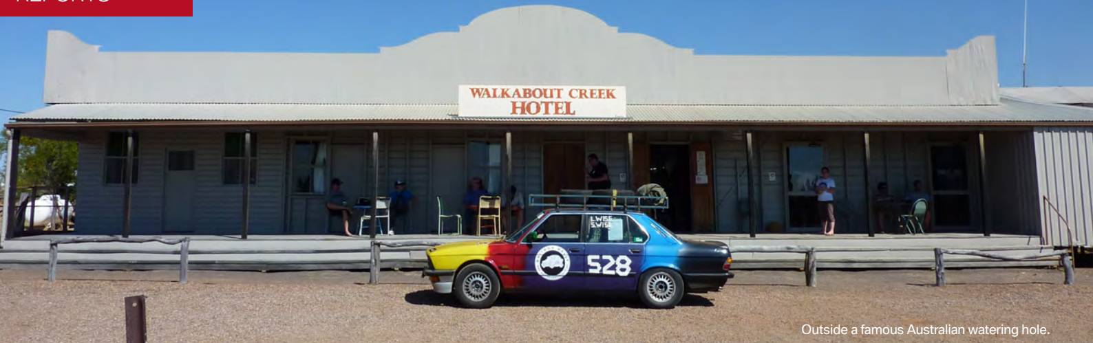
Outside a famous Australian watering hole.