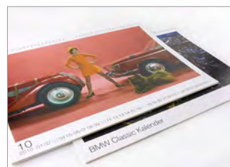
Individual BMW Classic Calendar. € 26.91