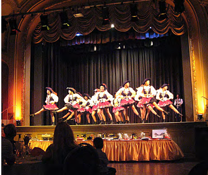
Highlight of the gala evening: the dance corps of the Siegburg musketeers.

At the end of the 170 km trip, all the coupés return safely to the Ziepchensplatz beneath the Dragon's Rock (Drachenfels). The first chancellor of West Germany, Konrad Adenauer, once lived in Rhöndorf and according to legend, it was at this rock that Siegfried slayed the dragon. The club members are welcomed by the Lord Mayor and the vehicles presented to the well-informed audience.