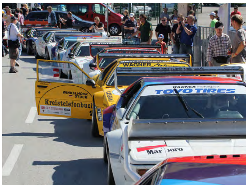
The Procars just before the grid.

September 10, 2011, Saturday, 9.00 am. We leave and make our way together to the Salzburgring, where we have arranged to meet our friends with their Procars; the meeting