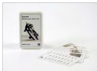
BMW Classic Happy Families. € 6.30